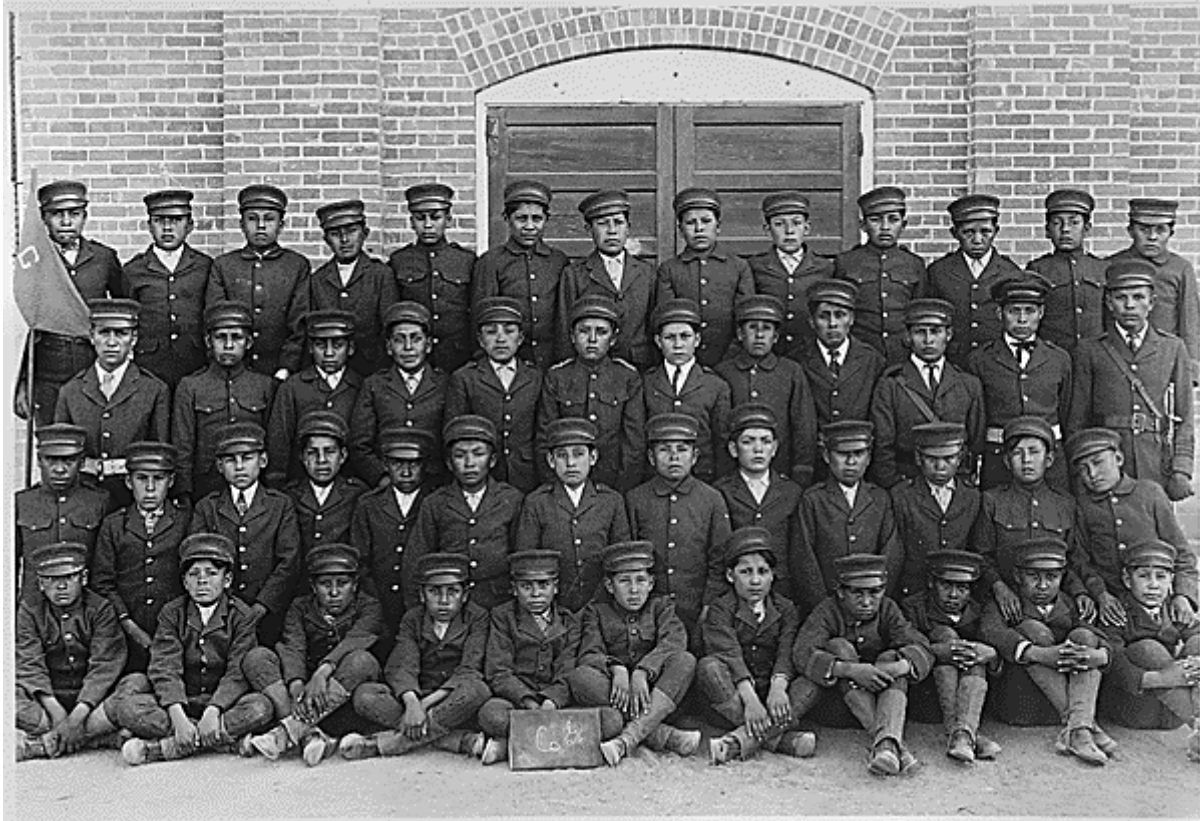
Founded 1885, it continued operation until 1982 when it transferred programs to the Santa Fe Indian School. Albuquerque, NM